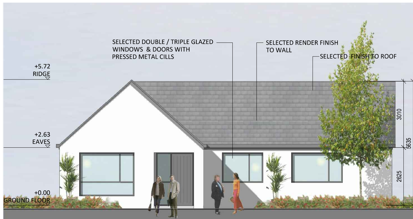
Front Elevation (North East) scale 1:100